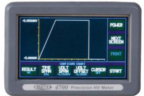
Chart Mode automatically plots voltage readings from a few seconds to several days. Highly useful for determining ramp linearity, overshoot and sag on hipot testers and other HV sources.

Automate your HV test requirement with the 4700's built-in Ethernet port, high speed serial communication port or available GPIB. The 4700 is fully programmable—so you can select your measurement mode and bandwidth, then take readings as often as desired. The 4700 also comes standard with a USB printer port, to capture readings and get hardcopy printouts of HV plots—so you can document the sag or overshoot in a typical hipot test.