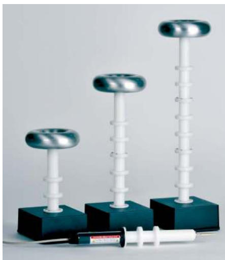
HVL Series High Performance Lab Grade, HV-SmartProbes™ shown above in 35KV, 70KV and 100KV models. Handheld HVP-35 portable HV-SmartProbes™ shown with detachable probe tip.

Vitrek's 4700 precisely measures voltages directly up to 10KV, right out of the box—with no external probes. That's high enough for most of the HV sources out there. However, should you care to expand your high voltage measurement range—just add one or more of the available 35KV, 70KV, 100KV and 150KV SmartProbes™. The Vitrek SmartProbes™ each store their own calibration data which is down loaded when they are plugged in to the 4700—this results in high accuracy, calibrated readings and allows any Vitrek SmartProbe™ to be used with any 4700 HV Meter. The SmartProbe's™ proprietary, ultra-low TC attenuator design minimizes self-heating—while its low capacitance technology enhances AC